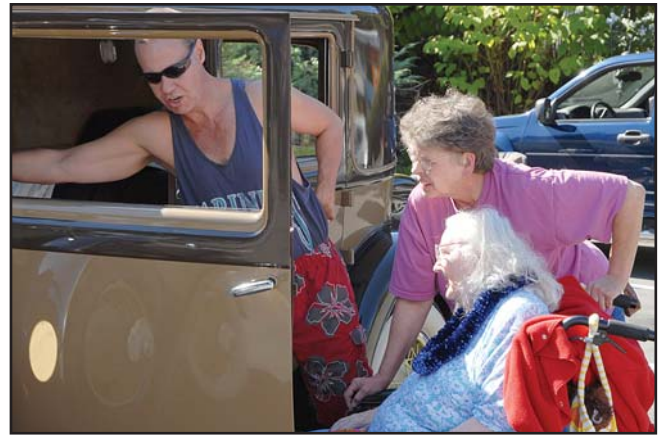
Checking out the beautifully restored 1931 Cadillac